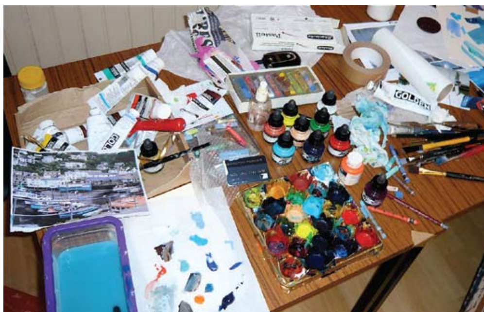
Very mixed media